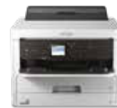
WorkForce Pro WF-C5290 Print