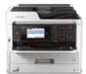
WorkForce Pro WF-C5790 Print/Scan/Copy/Fax/Email